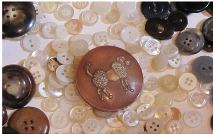
Can you find the poodle button that is part of “Biografika”?

“ Biografika ” will be on display at the MVTM from Saturday, August 3 rd through Saturday, October 19 th . The museum is located at 3 Rosamond Street East in Almonte. Museum hours are Tuesday through Saturday, 10 AM to 4 PM.