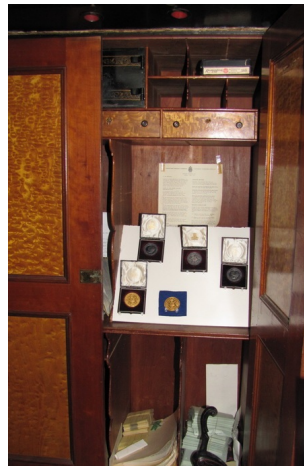
A glimpse into the Rosamond Woolen Company safe.