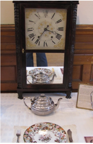
Rosamond Family artifacts exhibited for the Rosamond Family Reunion.