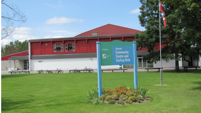
Almonte Community Center the site for 2013 Fibrefest, September 7 & 8.